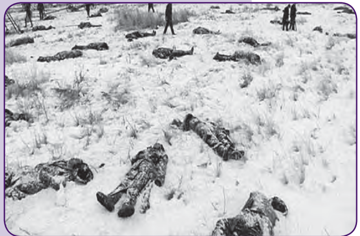
Wounded Knee, 1890